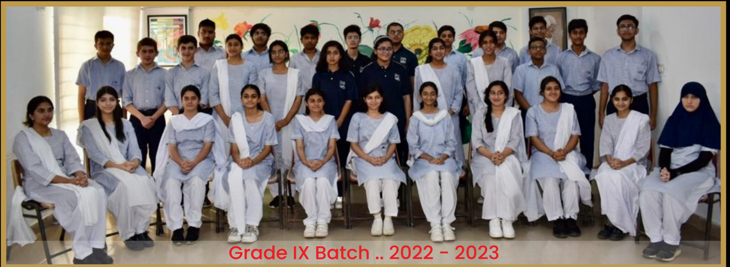
Grade IX Batch .. 2022 - 2023