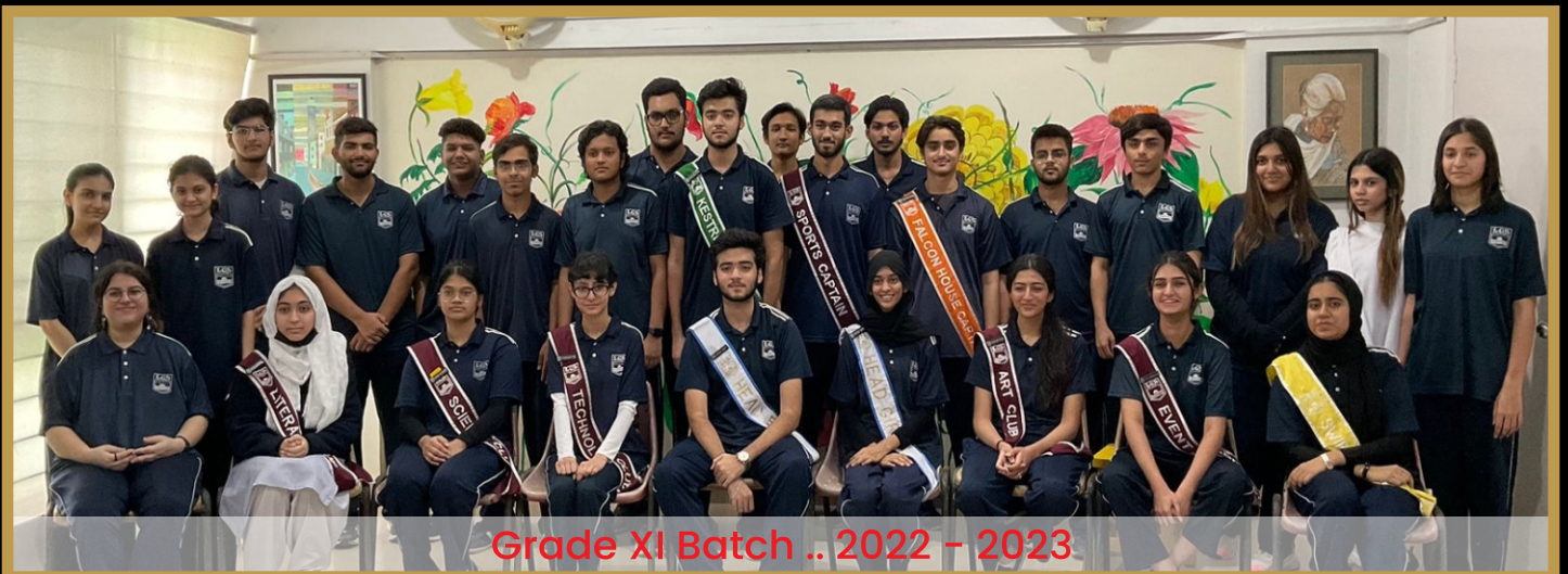
Grade XI Batch .. 2022 - 2023